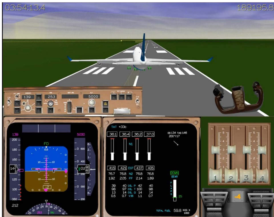
Figure 1: Aircraft in a Crab at Touchdown

The flight data was analysed and the animation was produced. The screen captures below indicated the rudder and ailerons input after touchdown.