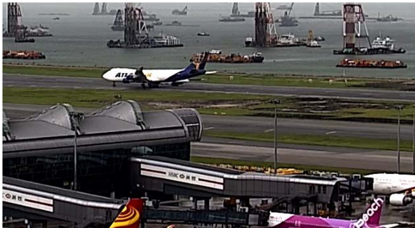
Photo 7: Veering to the Right, Left Wing High (Looking from 25R Direction)