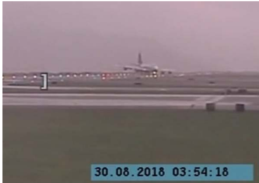
Photo 3: Aircraft Banking to the Left (Looking from 07L Direction)

The landing was captured by various CCTV cameras facing the directions of 07L and 25R at the runway.