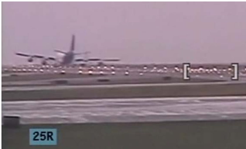
Photo 5: Aircraft Banking to the Right (Looking from 25R Direction)