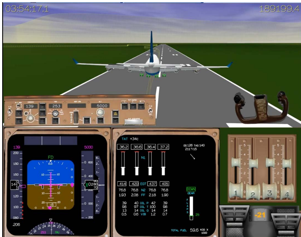
Figure 3: Full Left Rudder Applied

Figure 3 showed that the aircraft was on the centreline with ailerons neutral and full left rudder applied.