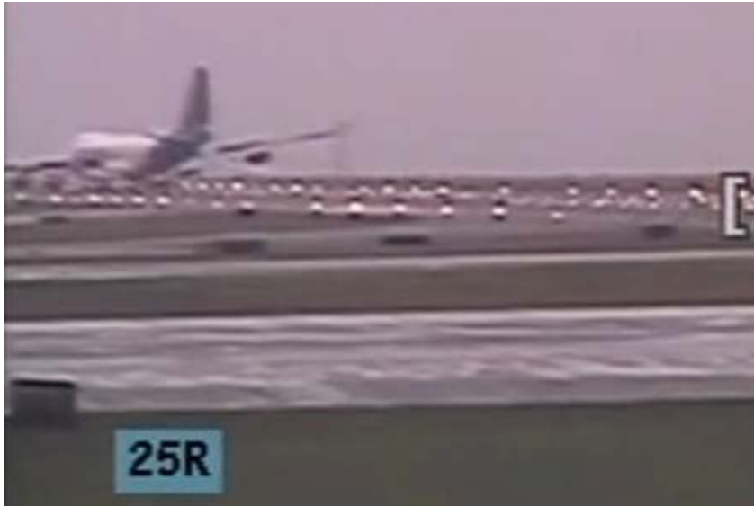
Photo 4: Aircraft Banking to the Left (Looking from 25R Direction)