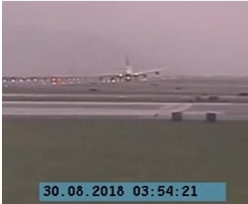
Photo 6: Aircraft Banking to the Right (Looking from 07L Direction)