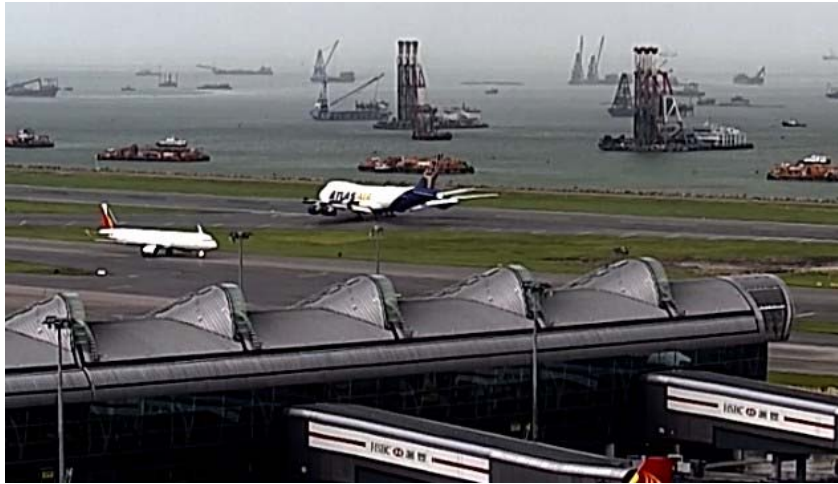
Photo 8: Aircraft Returning to Normal Attitude (Looking from 25R Direction)